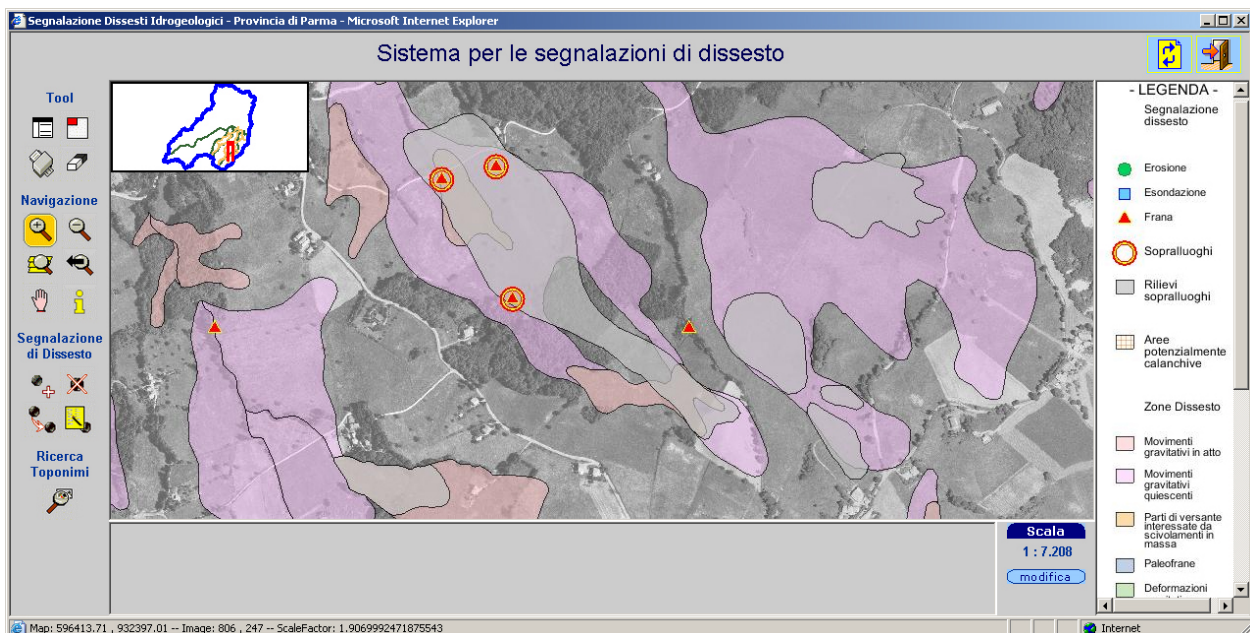
Fig. 2 Difesattiva on-line - ARCIMS layout: an example of updating of the Provincial Landslide Map based on field surveys. Red triangles are instability notification verified by field surveys

PETERS D. - (2003) - System Design Strategies - ESRI® White Paper .